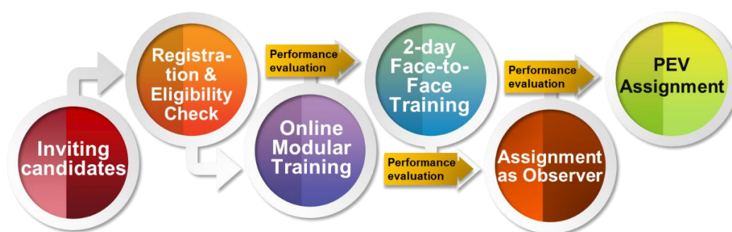
Fig. 3. Training series towards provision of quality program evaluators

Program evaluation is conducted by Program Evaluators having reputable academic and/or industrial background. High standards of recruitment and training processes are established to ensure competent evaluators (Fig. 3).