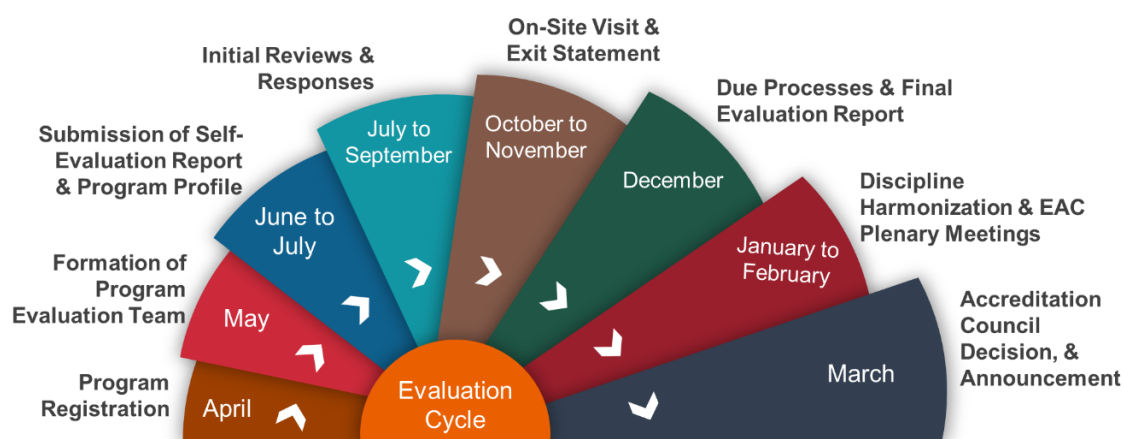
Fig. 2. Illustration of Common Criteria

IABEE evaluation process is conducted during a 12-month Evaluation Cycle (Fig. 2) and is implemented through IABEE Online Evaluation System (OES). The evaluation process in general is described as the following.