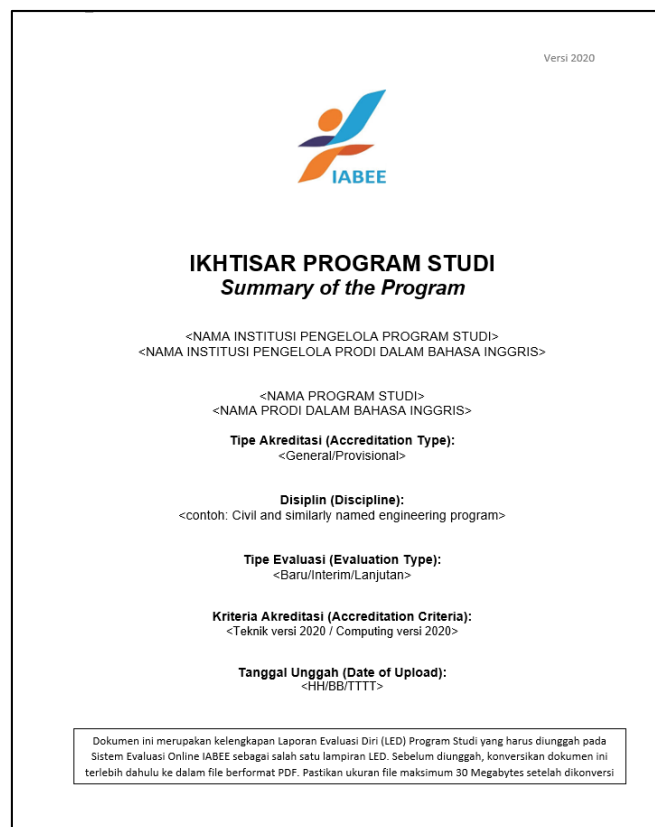
Fig. 5. A Program Profile template

Fig. 5 depicts the cover page of Program Profile template. Upon completion, this document is to be converted into PDF format and submitted to OES together with SER and other document(s) of supporting evidence.